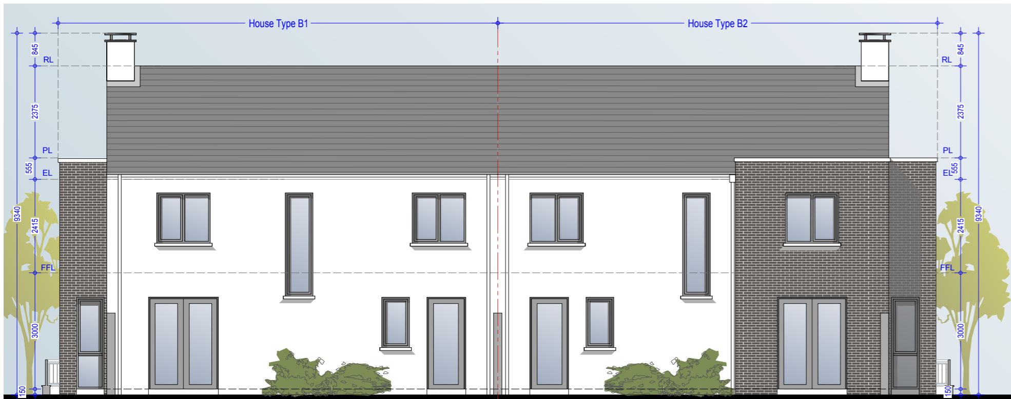
Rear Elevation - House Type B1 (End of Street)