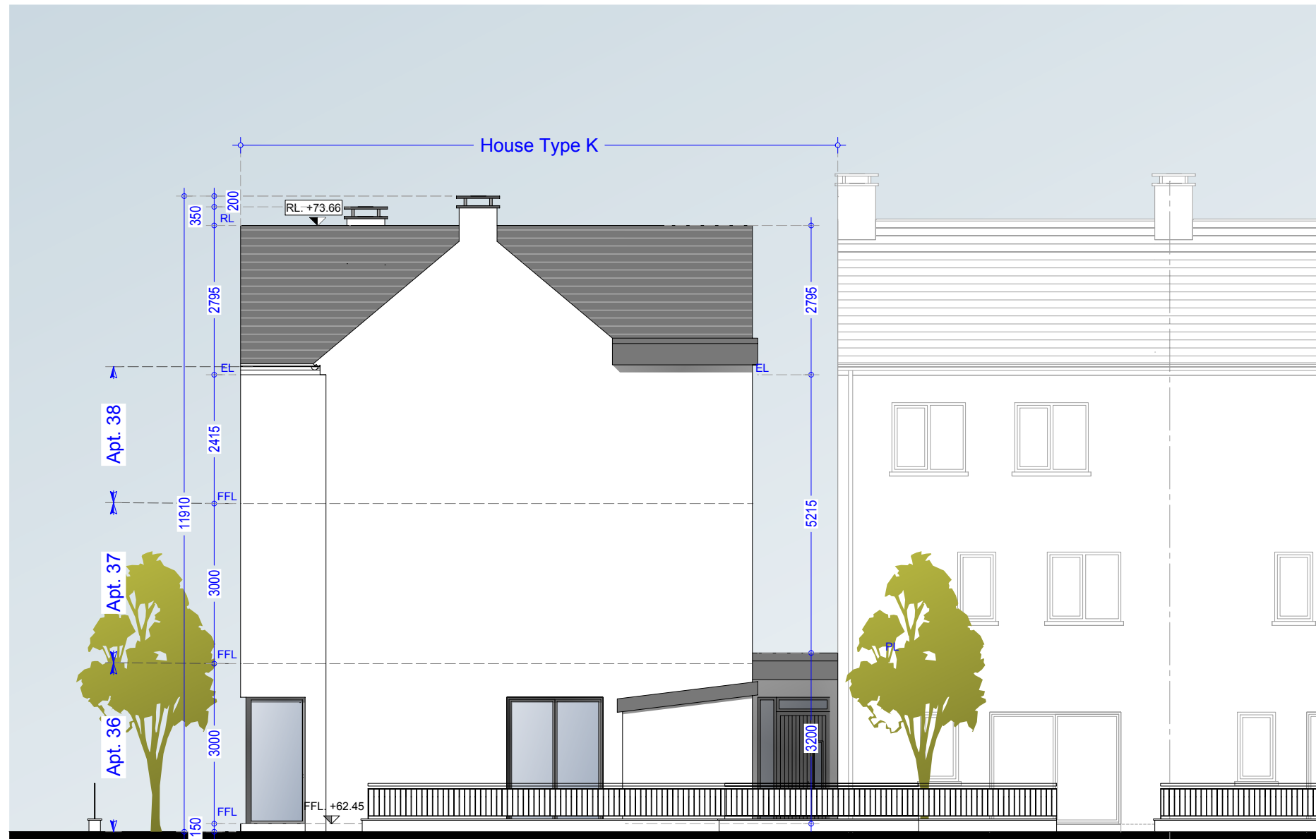
North west Elevation - 1Bed Apartments No. 36 to 38