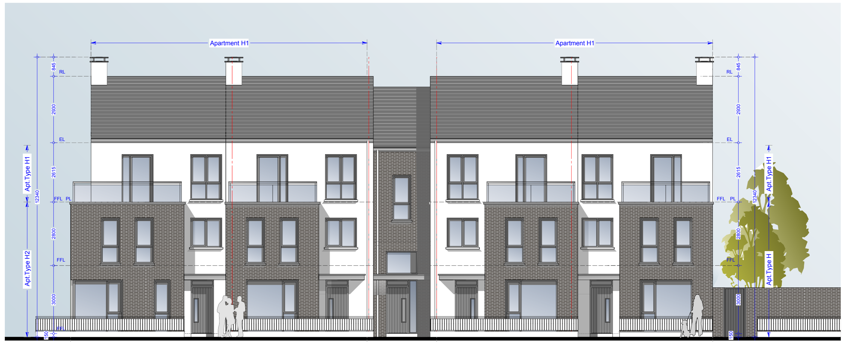
Front Elevation (Duplex Apartments) - Types H, H1 & H2